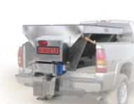
SAND & SALT SPREADERS