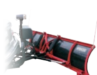
FULL-TRIP MID-SIZE PLOWS