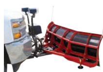
TRIP-EDGE SCOOP PLOWS