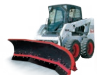
SKID-STEER SCOOP PLOW