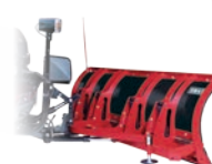
TRIP-EDGE CONVENTIONAL PLOWS