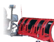
TRIP-EDGE CONVENTIONAL PLOWS