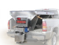
SAND & SALT SPREADERS