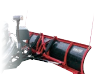
FULL-TRIP MID-SIZE PLOWS