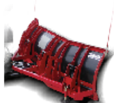
TRIP-EDGE SCOOP PLOWS