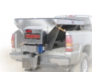
SAND & SALT SPREADERS