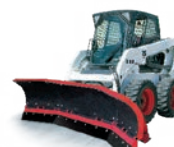
SKID-STEER SCOOP PLOW