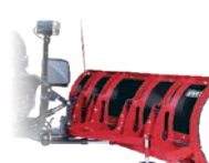
TRIP-EDGE CONVENTIONAL PLOWS