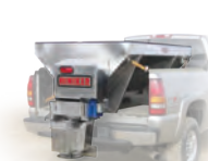
SAND & SALT SPREADERS