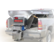
SAND & SALT SPREADERS