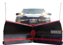
TORSION-TRIP V- PLOW