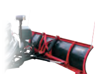
FULL-TRIP MID-SIZE PLOWS