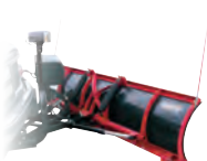
FULL-TRIP MID-SIZE PLOWS