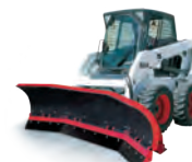
SKID-STEER SCOOP PLOW