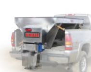
SAND & SALT SPREADERS