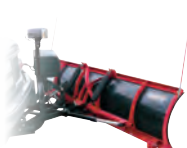
FULL-TRIP MID-SIZE PLOWS