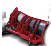
TRIP-EDGE SCOOP PLOWS