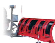
TRIP-EDGE CONVENTIONAL PLOWS