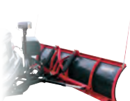
FULL-TRIP MID-SIZE PLOWS