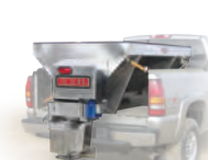
SAND & SALT SPREADERS