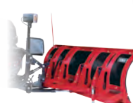
TRIP-EDGE CONVENTIONAL PLOWS