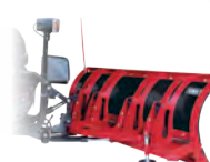
TRIP-EDGE CONVENTIONAL PLOWS